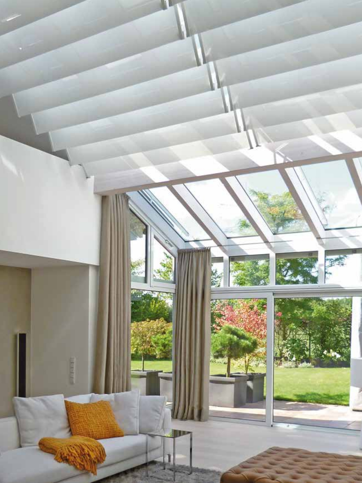
Skylight Shading System Silent Gliss 8800