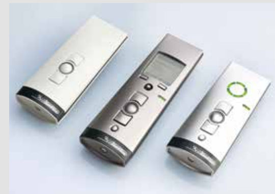
Remote controls Silent Gliss 9940